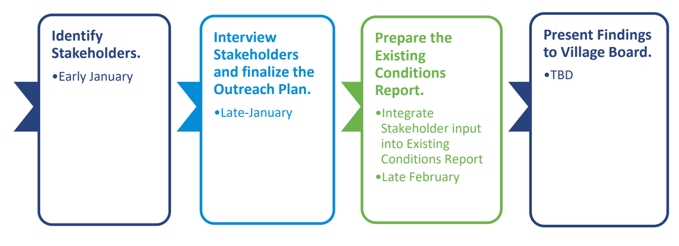
Figure 3 - Stakeholder Timeline

The following outreach activities are identified in the Village of Bellwood effort. Exact timing and format of these activities will be determined by CMAP with input from the Village team and the availability of the different stakeholders. Additional outreach activities may also be conducted, as needed.