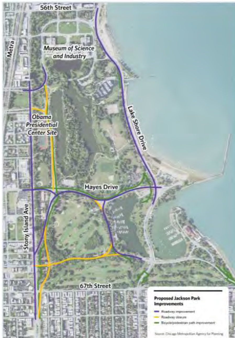
Figure 1. Proposed Jackson Park Improvements

The Chicago Park District recently updated its South Lakefront Framework Plan, part of which includes construction of the future Obama Presidential Center (OPC). 2 The Jackson Park Project would implement the update and support the OPC. In addition, CDOT has outlined two goals for the Jackson Park Project: